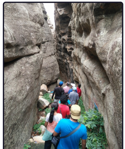
Pandavulagutta, a fabulous rock site we will visit during our November Rock Excursion.