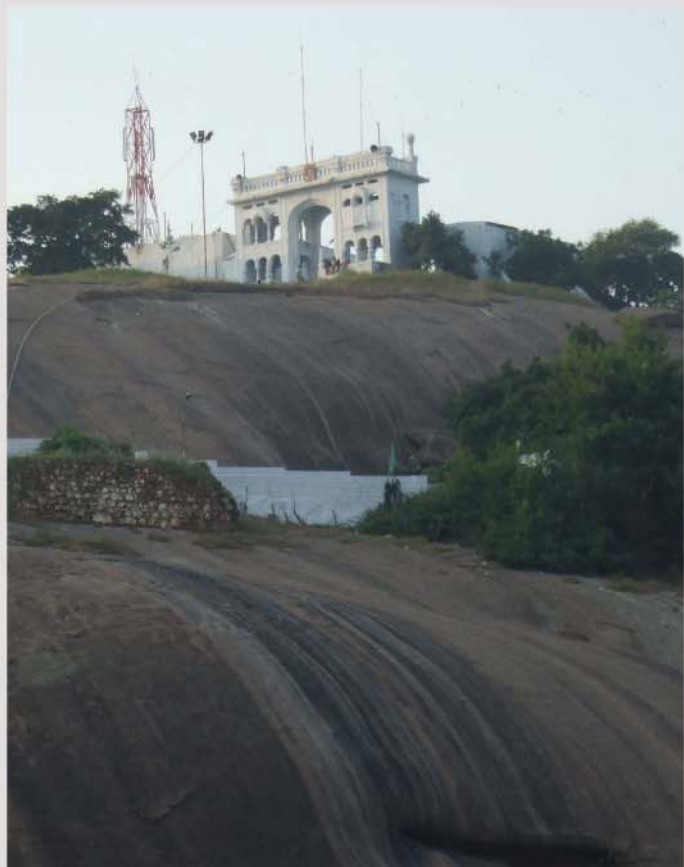
Mouli Ali with New Transmission Tower

Central Zone: Dattatreya Temple, Sitarambagh Rocks, Gangabowli Pahad