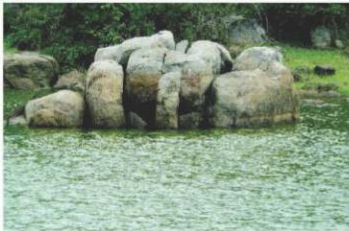
The serene Past