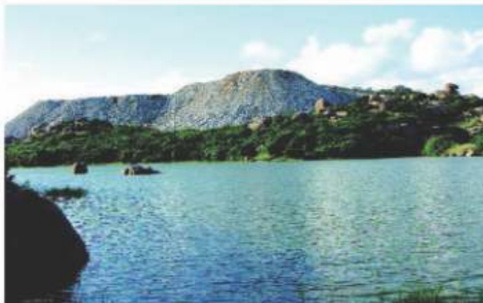
The devastated Present