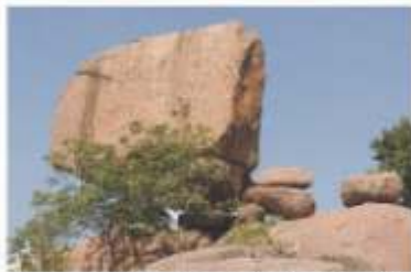
"United - We - Stand" Rock at MANUU

The Maulana Azad National Urdu University, Gachibowli, received this year's Heritage Award for the care with which they preserve the beautiful rock formations in their campus.