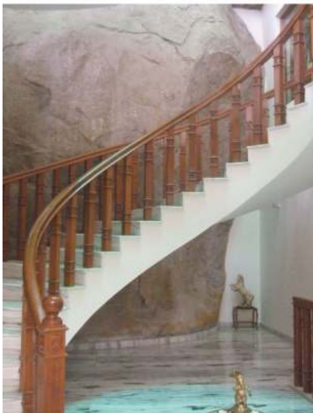
The same rock decorates the Drawing Room