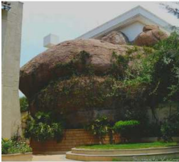
Sujatha's rock extending into neighbour Soma Chatterjee's beautiful garden, where it is carefully preserved.